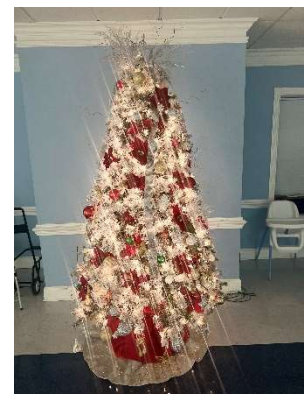
The Christmas decorations go up in Madden Hall, 11/29/22.