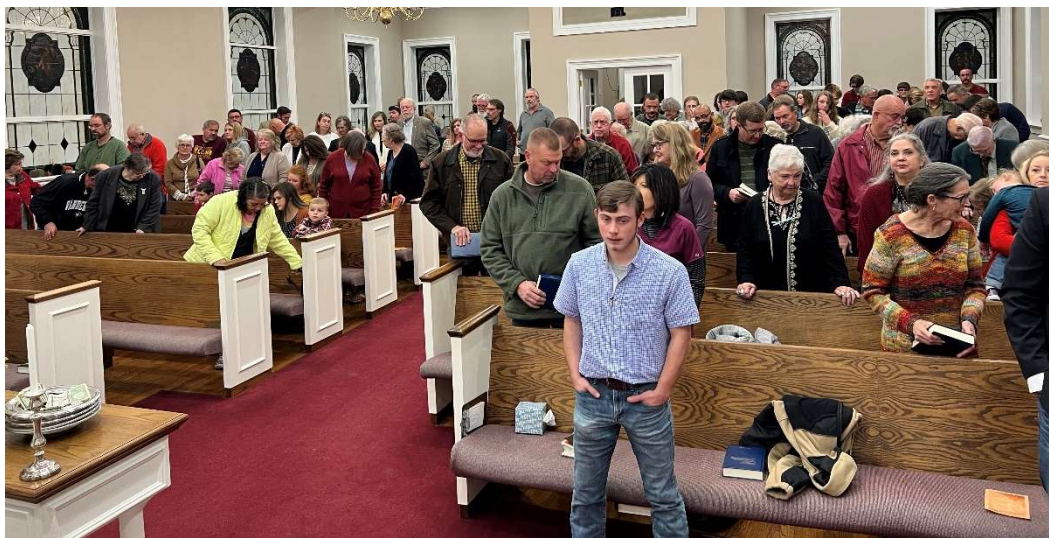
The Community Thanksgiving Service, just after the “Amen” to the Benediction

NORMAL CHURCH OFFICE HOURS: Monday, Tuesday, Wednesday, Thursday 8:30 AM to 4:00 PM, Closed: New Year's Day, Memorial Day, Independence Day, Labor Day, Thanksgiving, Christmas Eve & Christmas Day