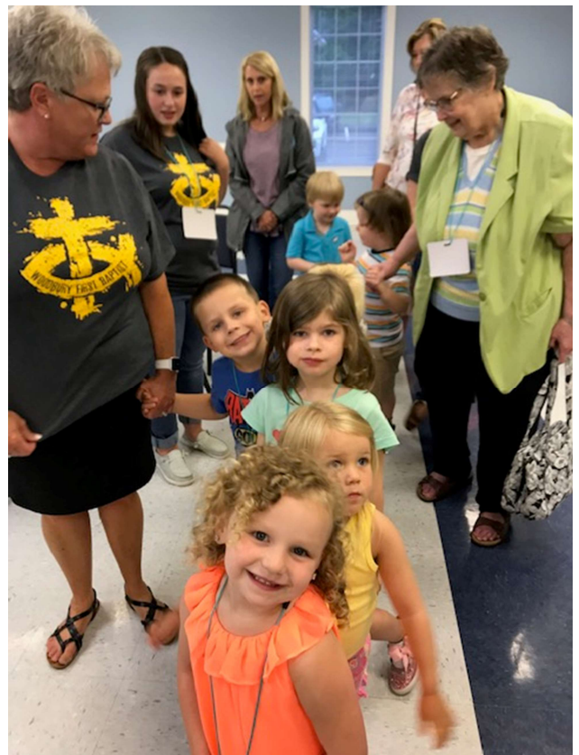
The VBS Preschoolers line up after supper, 7/11/21