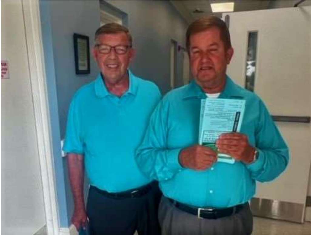
Our friendly, color-coordinated greeters are ready to welcome you!