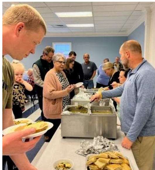
Our friendly staff is eager to serve you!